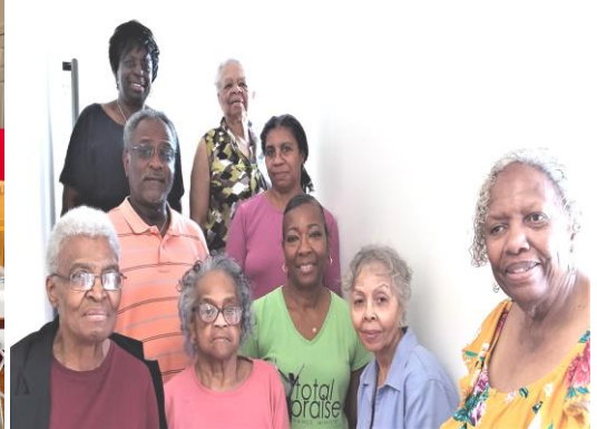
Station 1 – Calling on God Stations 5-FATHER, 6-SON & 7 –HOLY SPIRIT Some of the committee members & attendees.