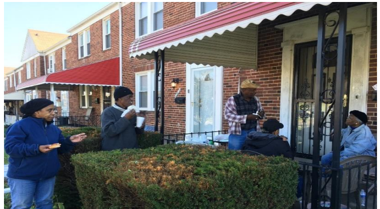
Areas cleaned up (Yah) NOW, the dumpster's gone too.